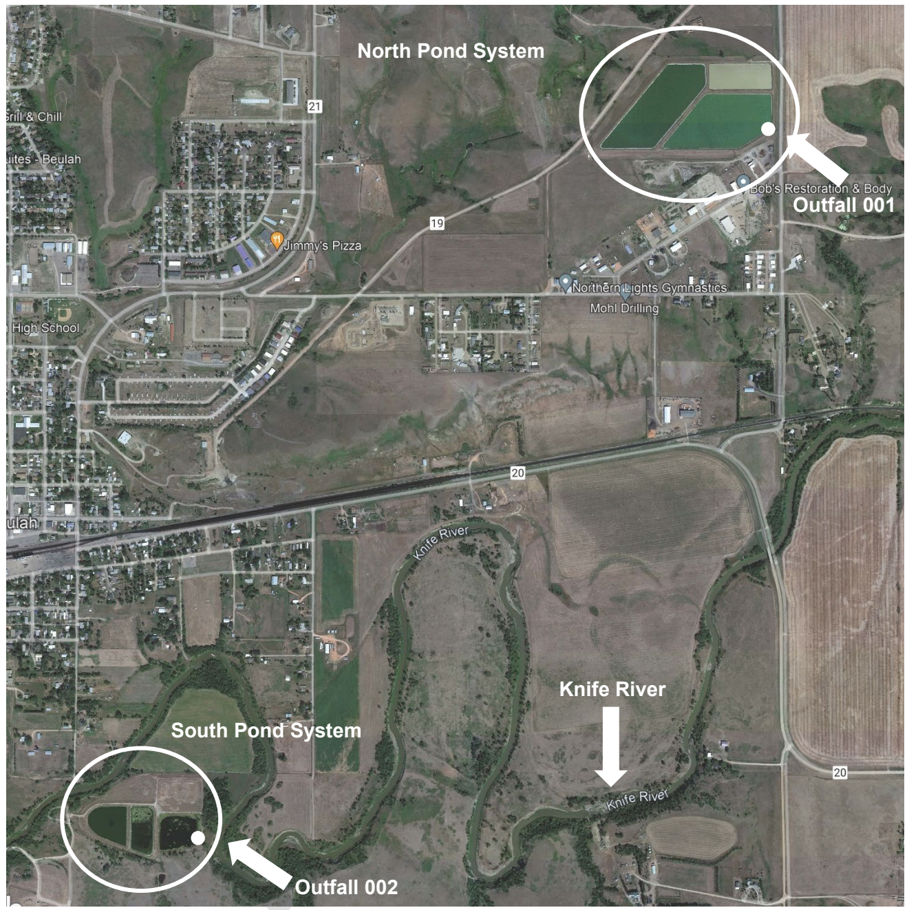
Figure 1 – Aerial Photograph of the City of Beulah – Beulah, ND (Google Earth 08/20/2022)