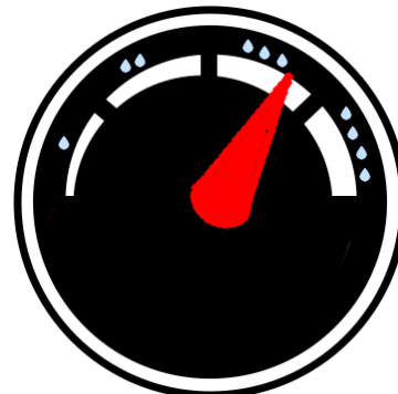
Indicates Liquid in the Interstitial Space