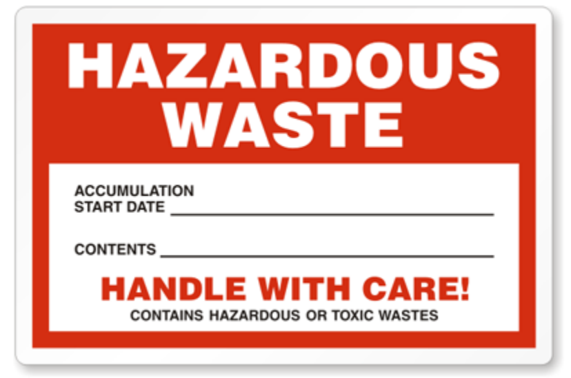
Generic label example