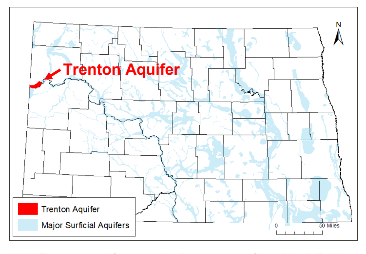
2020 Trenton aquifer permitted water use (from North Dakota Department of Water Resources (dwr.nd.gov)) ↓