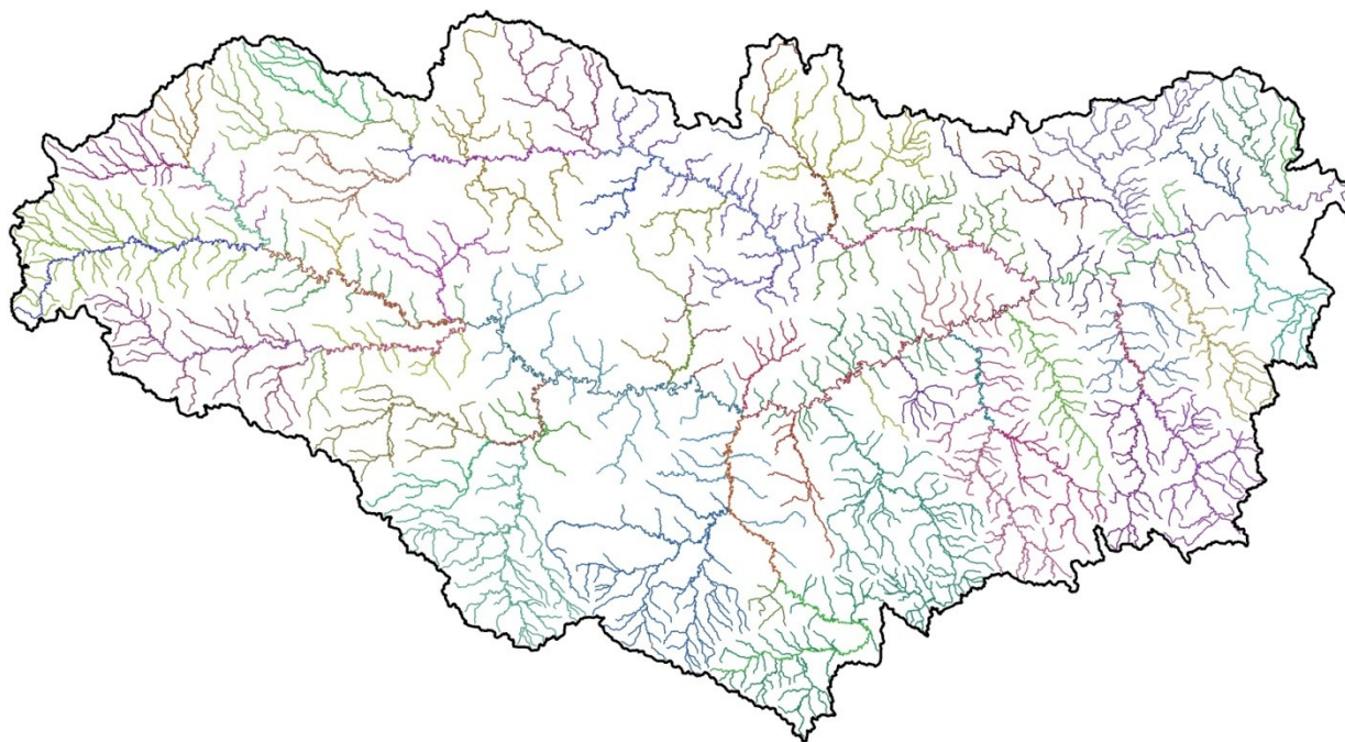
Figure 1. Map of Reach-Indexed Assessment Units Delineated in the Knife River Sub-basin (10130201).