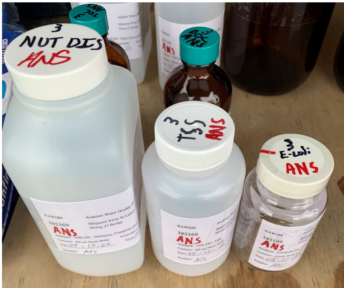
Figure 2: Properly labeled 500 ml, 250 ml and 125 ml bottles (left to right, respectively) from samples taken in a region where ANS are known to be present.