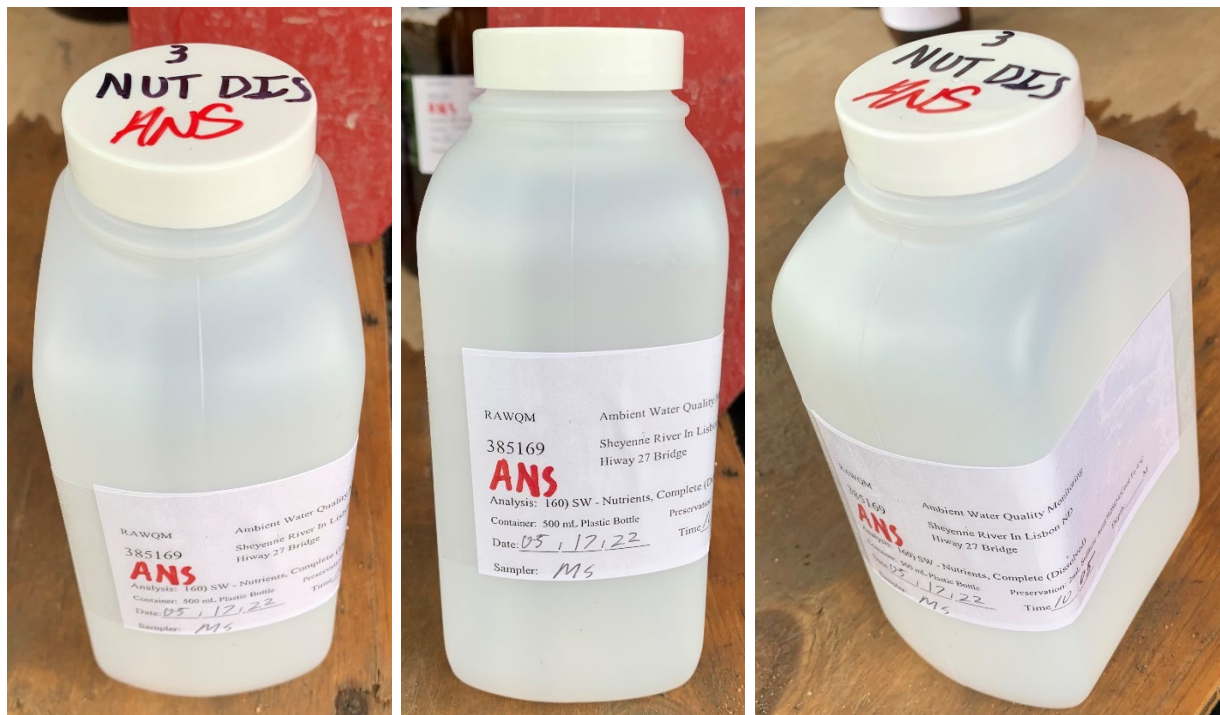
Figure 3: Properly labeled 500 ml bottle for sample taken from a region where ANS are known to be present.